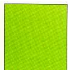
MEDALLION™ F.M. GREASE